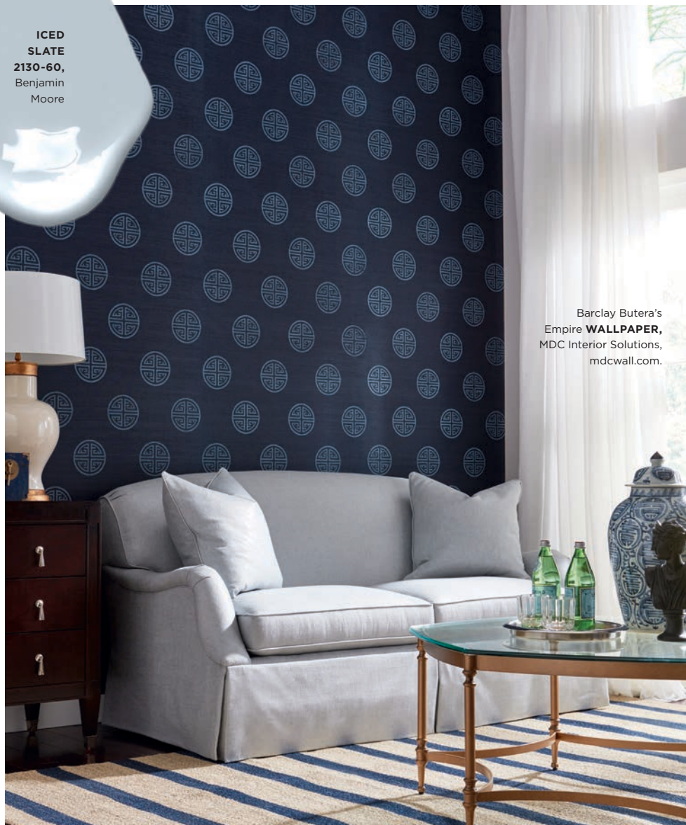
Barclay Butera's Empire WALLPAPER , MDC Interior Solutions, mdcwall.com .

KL: Do you have a favourite contrasting colour when decorating with blue and white? What about a favourite neutral to accompany the pair?